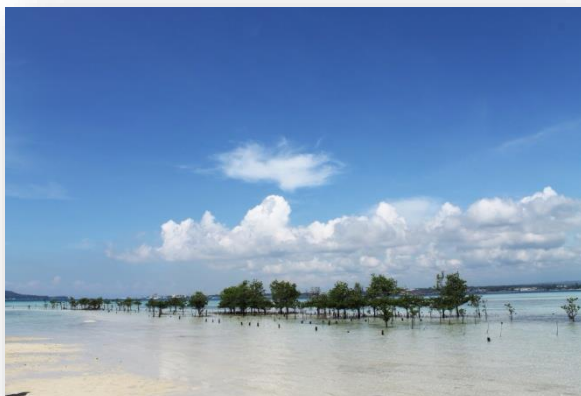
Sanipaan – Samal Island