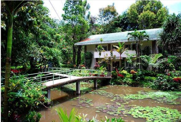
Philippine Eagle Center