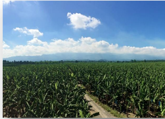
Hijo Banana Plantation