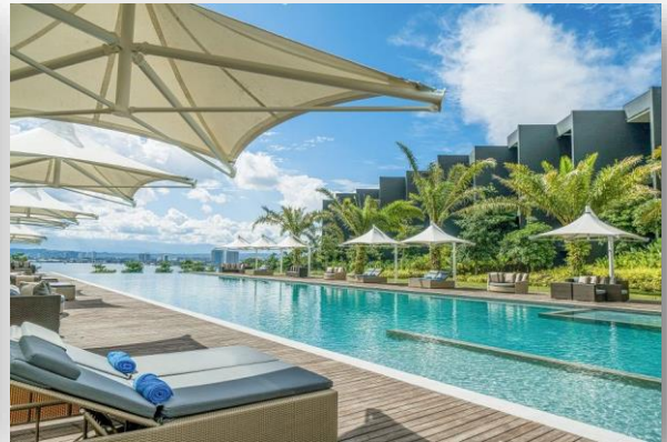
Discovery Samal Resort