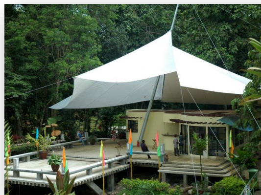
Philippine Eagle Center