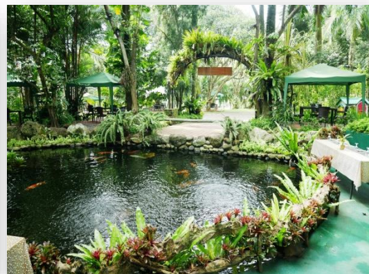
Malagos Garden Resort