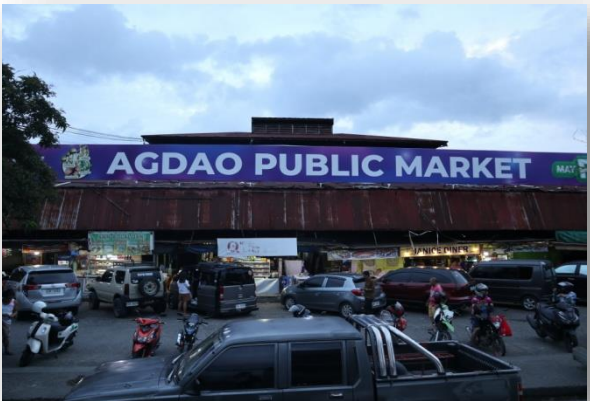
Agdao Public Market