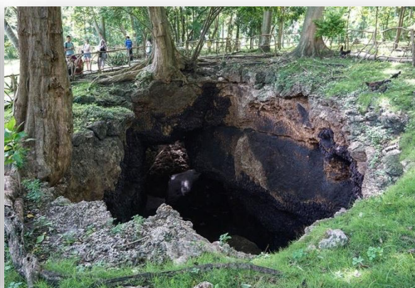
Monfort Bat Cave