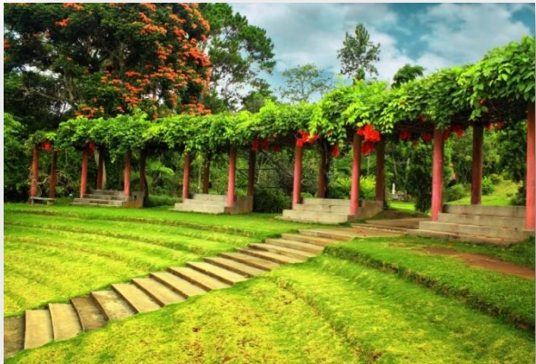
Eden Nature Park